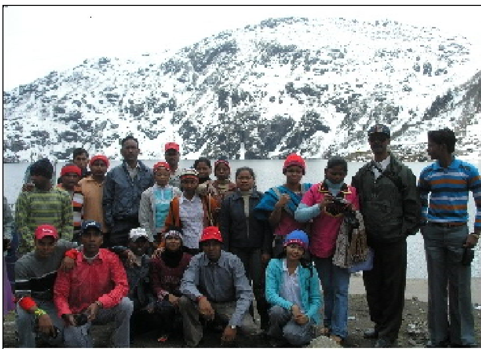
STUDY TRIP OF STUDENTS FROM RANCHI COLLEGE

The institution strives for the holistic development of students and caters to their needs for progression in academic as well as curricular and extracurricular activities such as sports, debate, quiz contests, cultural activities and others. It also encourages them to have a feel of the external environment through study trips and visits to various institutions so that they know about the national and global demands.